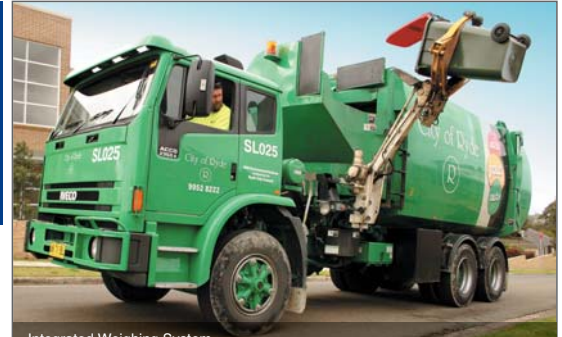
Integrated Weighing System